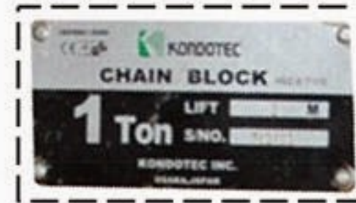
KT-C Chain Block (Double Chain)